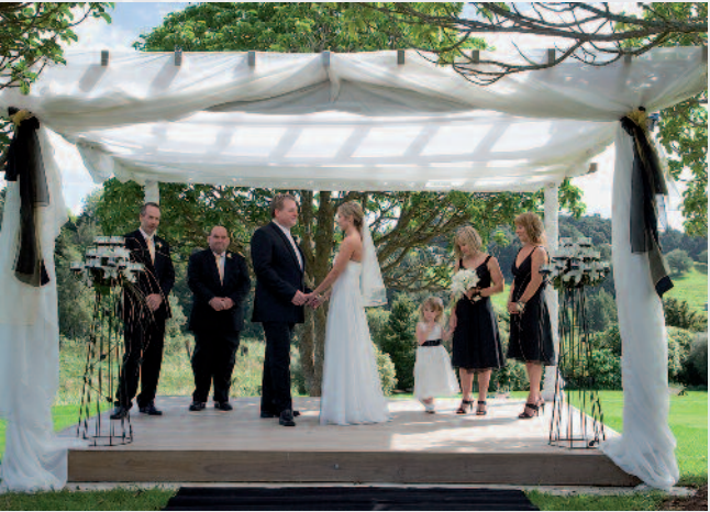
Kerri Verma Photographer

Its many features include the options for you to select caterers of your choice and to choose and provide your own beverages. Carparking is easy and the building is fully air conditioned. Your guests will be captivated by the landscape and the wide open spaces provide the perfect backdrop for stunning, unique photographs.