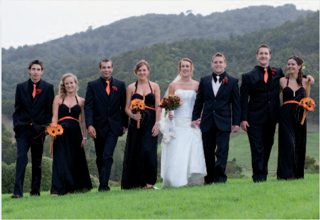
Kerri Verma Photographer